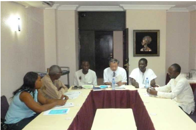
The First World Party Convention Ghana, Africa, August 2011

At present, there is no World Federation and World Government. So, the World Party is aiming to establish the World Parliament without the legislative power like the European Parliament.